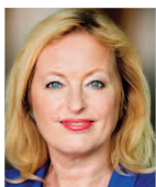
Prof. dr. Jet Bussemaker

President Royal College of Nursing United Kingdom Professor of Nursing Policy, King's College London